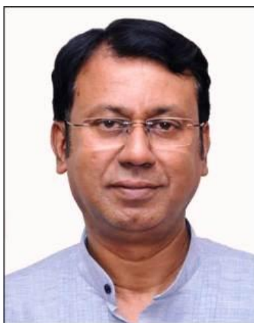
Arun Kumar Jha, Director General, National Productivity Council

In order to bring in more synergy among the offices of Commerce & Industry Ministry, it was recommended that all these offices should be co-located in the same city. The Minister further desired that NPC should try to replicate the Delhi Police Model of Automated Transfer & Posting System, developed by NPC, for other Government Organizations, including Railways. He also emphasized that NPC could render its services to Indian Railways which is largest government employer in the country.